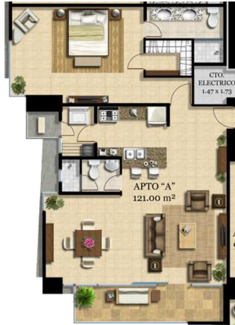
View to the Boulevard