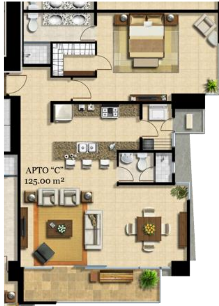
View to the Boulevard