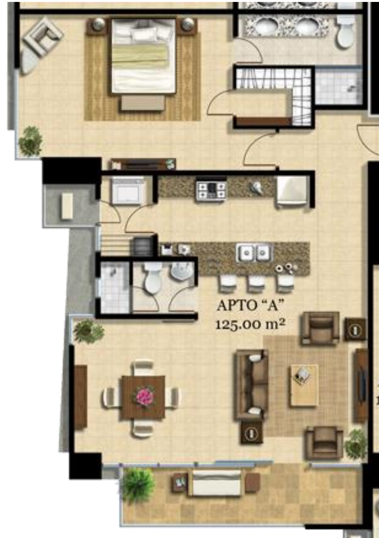
Vista al Boulevard

LEVELS 600, 700, 900 - 1300, 1500- 1900, 2100-2500, 2700, 2800, 2900, 3600, 4400