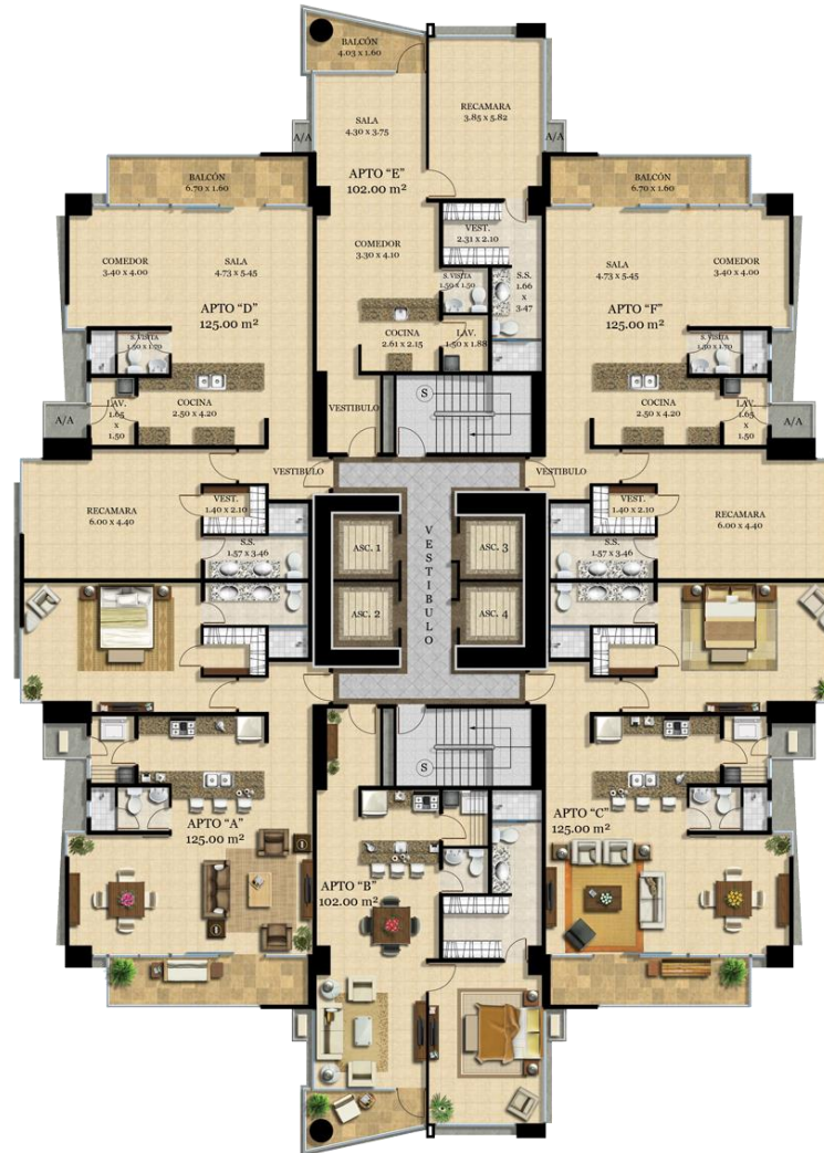
Vista al Boulevard