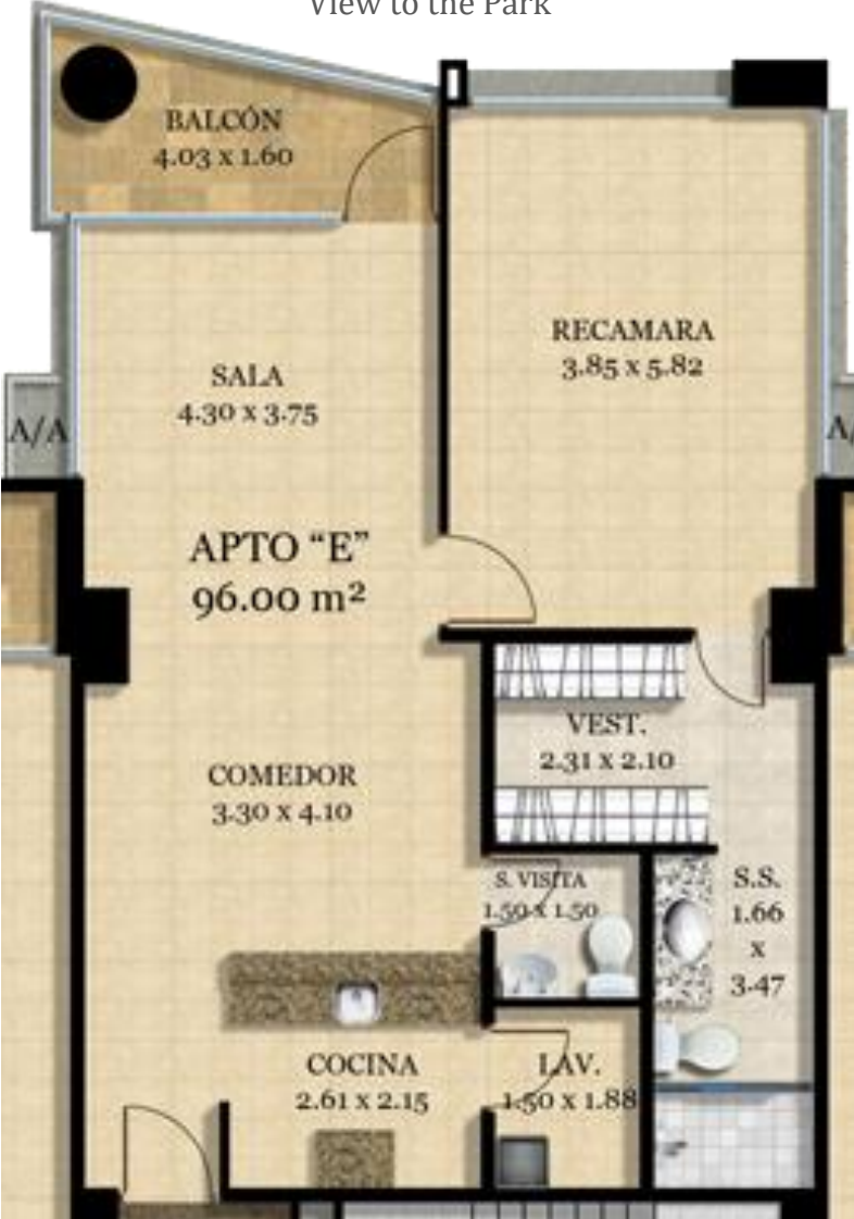
View to the Park