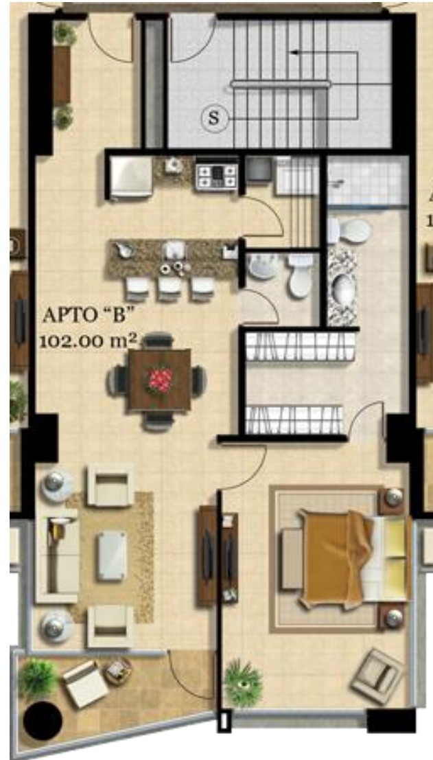
Vista al Boulevard

LEVELS 600, 700, 900 - 1300, 1500- 1900, 2100-2500, 2700, 2800, 2900, 3600, 4400