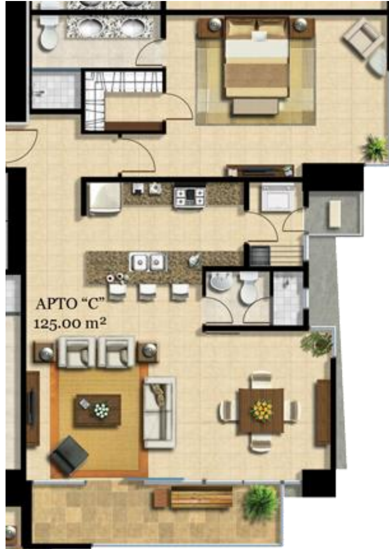
Vista al Boulevard

LEVELS 600, 700, 900 - 1300, 1500- 1900, 2100-2500, 2700, 2800, 2900, 3600, 4400