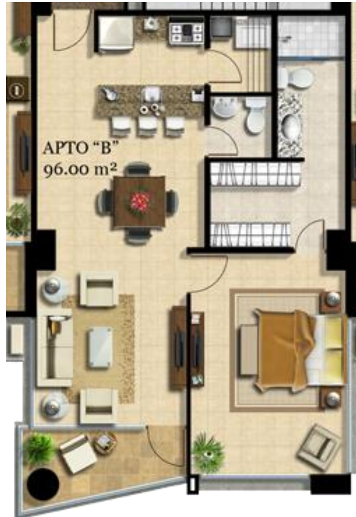
View to the Boulevard